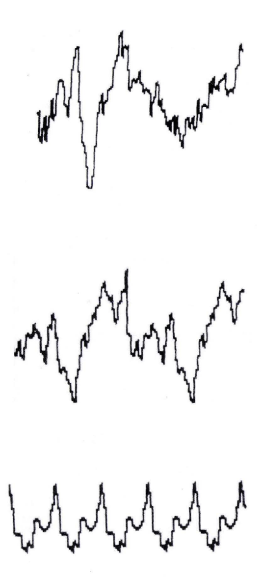
Figure 2: The first wave represents the original visual ERP with \Delta t_{buffe} = 1 s recorded with electrodes placed on the scalp in Temporal Anterior and Temporal Posterior areas. The second and third waves are the periodic detected waves of 2Hz and 5Hz, respectively.