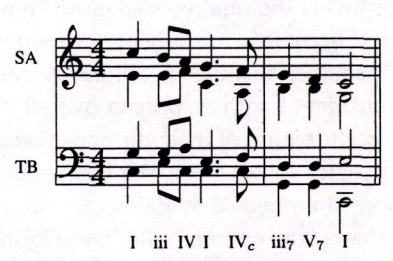
Figure 1: Harmonisation of first line of "Joy to the World"

Figure 1 shows a harmonisation by our system of the first eight notes of "Joy to the world". The output is not perfect, but it is surprisingly good given the limited rules built in to the system. All the output of the system was marked by Dr. John Kitchen, a lecturer in the Department of Music at Edinburgh, according to the criteria he uses for 1st year undergraduate students' harmony. This example scored 5 out of 10 - a clear pass. While other examples were less successful (most earning around the 30% mark), this was mostly due to the lack of coherent large-scale musical progression – the system was felt to be better than student harmonisers at getting the basic rules right.